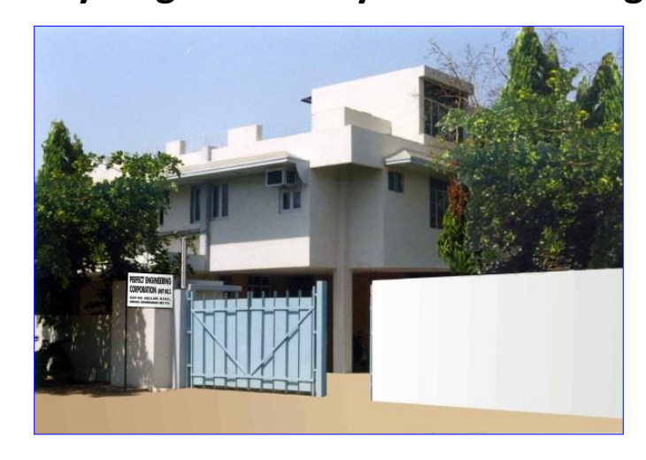
Administration & Assembling