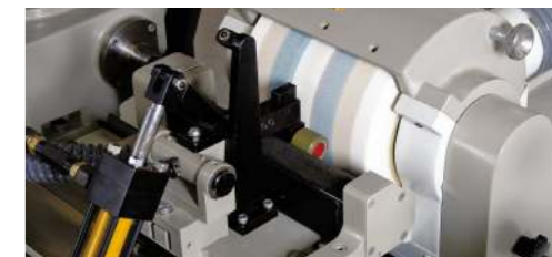
Cot Grinding of Ring Frame Top Roller